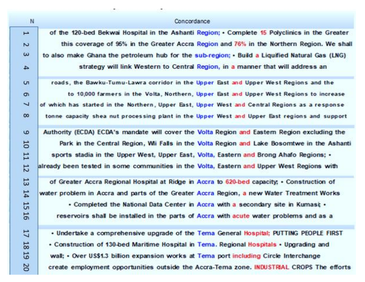
Figure 3: Sample concordance lines indication geographical locations mentioned by the NDC

The NDC manifestos also expound attachment to the NDC's strongholds by making references to such places (see Figure 3). The Upper East and Upper West (lines 5–8) and Volta (lines 9–12) regions are known NDC strongholds, while the Greater Accra Region (lines 13–16), including Tema (lines 17–20), is an important political enclave for both political parties as a result of its swing nature and determination of elecotral outcomes. The assumption is that the NDC (have) either initiated, commenced or completed programmes and projects in these areas.