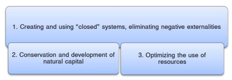
Figure 2. Principles of Circular Economy

In order to meet modern economic challenges related, on the one hand, to scarce, finite and increasingly expensive resources, and to environmental needs, on the other, circular economy is based on three fundamental principles. They are summarized in following Figure: