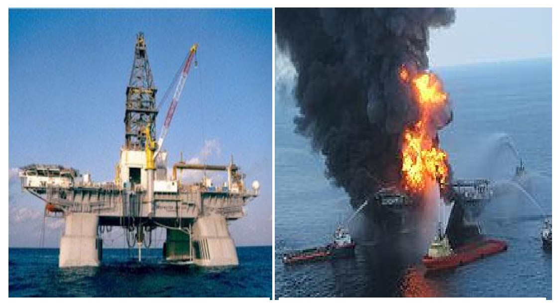
Fig.1 Deepwater Horizon prior to explosion

Deepwater Horizon oil spill was the largest oil spill ever in the United States compared to the previous spills, like Exxon Valdez oil spill of Prince William Sound, in terms of volume of oil spilled and its impact to the environment and the indigenous biota as well as human health. Although, most of the workers escaped the rig explosion by life boats and helicopters for medical treatment but still eleven workers were missed