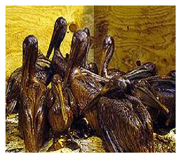
Fig.5: Heavily oiled Brown pelicans wait to be cleaned of Gulf spill crude.

When marine oil spill happened, it usually causes immediate harm to the entire environment and living organisms present. Other consequences of the oil spill will follow after long period of time. These long term effects usually manifest to the