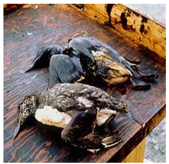
Fig. 6.Wildlife was severely affected by the oil spill

indigenous flora and fauna gradually as a result of changes in the chemical composition of the water (habitat) and physical alteration of the habitat (Neff, 2002). The short term effects of the oil spill manifest on the marine species, and leads to the high mortality rate and physical smothering due to the exposure to toxic effects of the oil (Dicks, 1998). A typical example of these short term effects happened during Exxon Valdez oil spill in 1989 at Prince William Sound (USA), which caused high toll of sea birds and marine mammal mortality as a result of oiling of plumage/fur, and death by drowning or starvation. The oil on the fur and feathers destroys the insulation value of the wild life and then causes them death by hypothermia. Ingestion of oil by the sea birds and mammals while trying to clean off their fur and feathers or scavenging