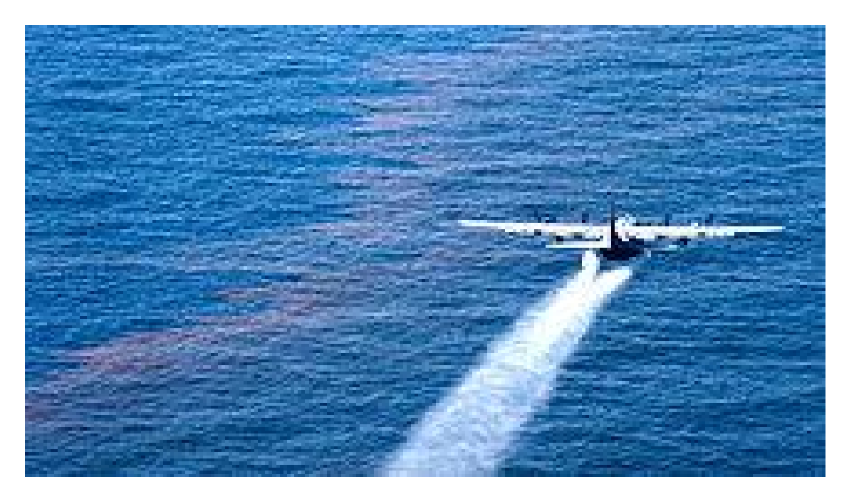
Fig.8. A C-130 Hercules drops an oil-dispersing chemical into the Gulf of Mexico

Similarly, dispersants mixes the oil through the water column, increasing the exposure of marine organisms to the oil particularly in shallow water where there is possibility of having high concentrations of oil to reach the seabed and therefore exposing the organisms to the harmful concentrations of oil which could lead to death. (SEEEC, 1998, Samuel K., 1989).