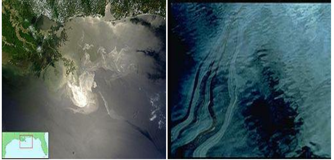
Fig.3 oil slick as seen from the space at Golf of Mexico (WIKIPEDIA, 2011).

despite the coast guard search operation for some days, and are presumed to have died in the explosion. About 4,900,000 barrels (206,000,000 US gallons) of crude oil was estimated to have spilled into the sea and eventually spread on the water surface and coastal shorelines after some days, which covered an approximate area of 2,500 to 68,000 square miles (6500 to 180,000 km<sup>2</sup>) (WIKIPEDIA, 2011).