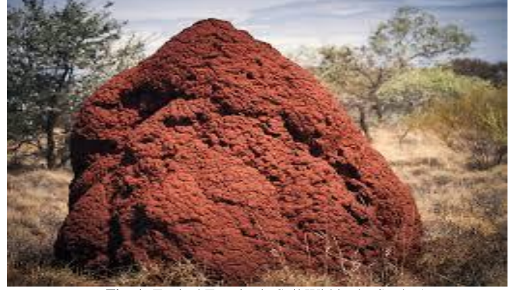
Fig. 1: Typical Termitaria Soil Within the Study Areas

In tropical savannas, trees associated with termites' colonies remained green throughout the year due to the sustenance of water from termite colonies well into the dry season (Turner, 2006). African farmers also collect termite mound soils and apply to cropped fields as it can be rich in available nitrogen, total phosphorus and organic carbon than adjacent soil (lopez-Hernandez et al , 2001).