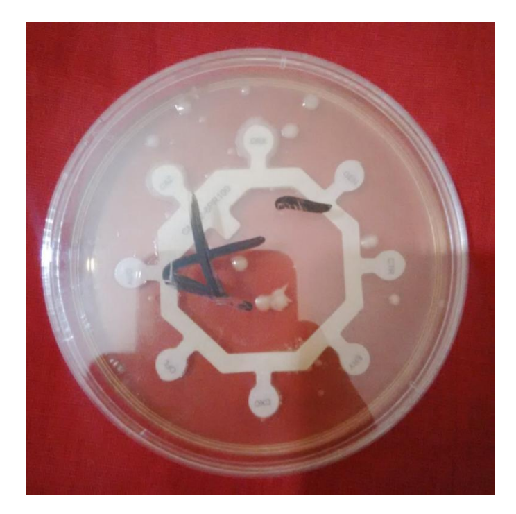
Plate 2: Antibiotics susceptibility testing

The experiment was conducted using the disc diffusion method (Krishnan et al. , 2019) following the instructions provided by CLSI (2018) on Muller –Hinton agar after normalization of broth to 0.5 McFarland standard to test all the isolates against a panel of fourteen distinct antibiotics. The antibiotics utilized include ceftazidime, cefuroxime, gentamicin, ceftriaxone, cloxacillin, augmentin, ofloxacin, erythromycin, ciprofloxacin, augmentin, nitrofurantoin, penicillin, cefixime, and novobiocin (Oxoid, UK). Three concentrations of antifungal stock solution were prepared for fungi. Sterile perforated filter papers were then dipped into each stock solution using a sterile forceps. Antifungal agents of three different concentrations (Griseofulvin, Itraconazole, and Ketoconazole) were determined for each isolate. The papers were incubated at room temperature for 48 hours (Plate 2).