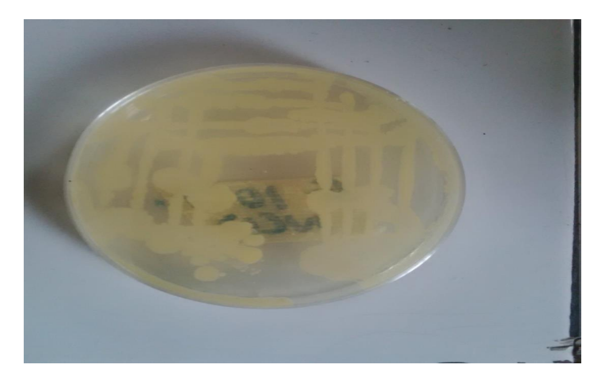
Plate1: Bacterial growth on nutrient agar medium

presence of any growth. The discrete colonies that formed were transferred to new culture plates and placed in an incubator at a temperature of 37 °C for a duration of 24 hours (Ogodo et al., 2022). (Plate 1).