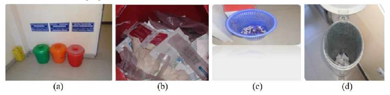
Figure 4. Waste collection and storage systems near the beds (a and b), outside the bed rooms (i.e., in corridors) (c), outside the wards (d) in the Private Hospital, Shashemene, Ethiopia

had no separate bins for the collection infectious waste (Debere et al. , 2013). As to WHO (2014), segregation of solid wastes should be performed by the producer of the waste as close as possible to its place of generation.