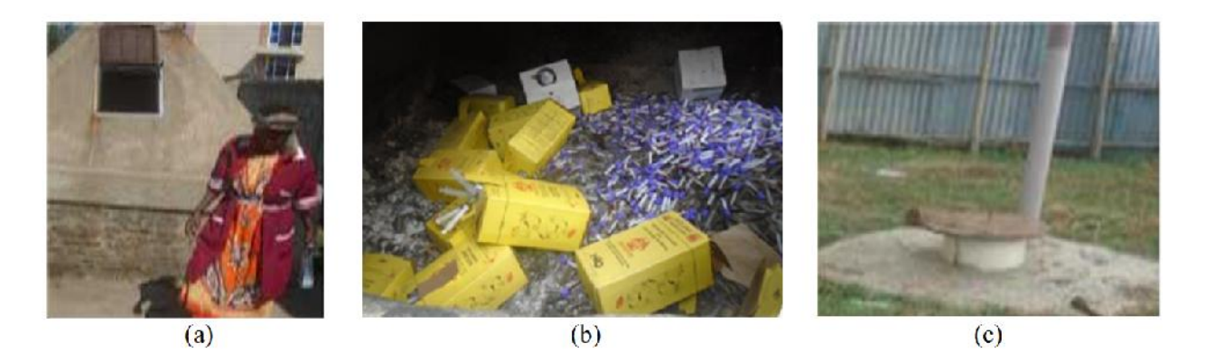
Figure 7. Solid waste treatment methods: Incineration (a and b), and (c) Anatomical, Pathological and Placental pit employed in the Private Hospital