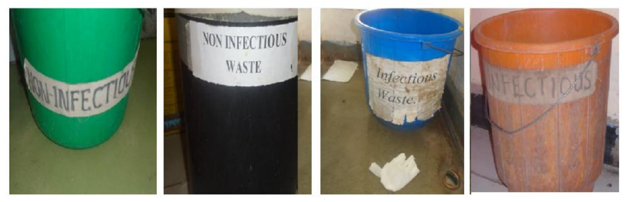
Figure 3. Cases where there were Color Code–Label Mismatches in the Government Hospital

On the other hand, only 25% of the respondents from GH acknowledged that the wastes were segregated at the point of