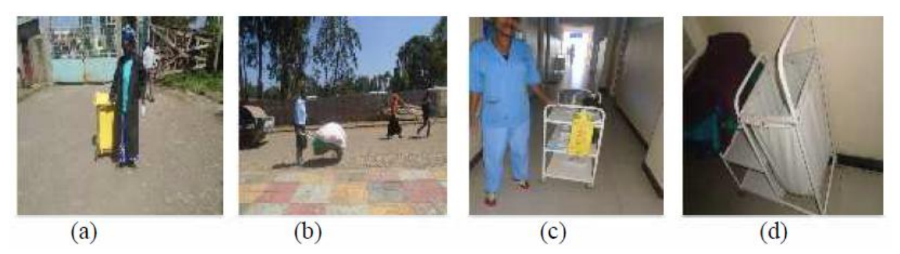
Figure 5. Healthcare solid waste transport in the Government (a, b) and Private (c, d) Hospitals