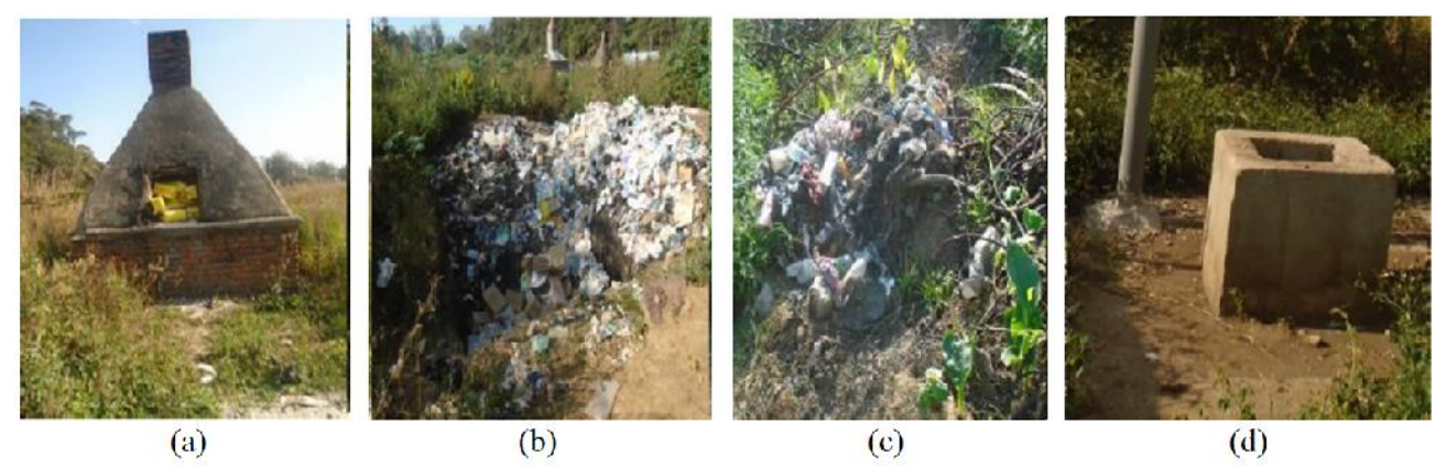
Figure 6. Solid waste treatment methods: (a) Incineration, (b and c) open burning at waste dump site and (d) Anatomical, Pathological and Placental burial pits in the Government Hospital of Shashemene town.

Generally, each component of HCW management practices in both surveyed hospitals did not conform to the Ethiopian National Healthcare Waste Management Guideline. Such poor HCW management were also reported in similar studies conducted in Nigeria (Di Bella et al. , 2012), South Africa (Nemathaga et al. , 2008), and Iran (De Titto et al. , 2012).