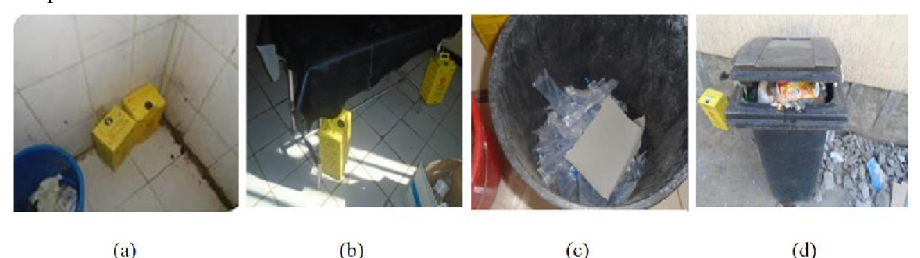
Figure 2. Waste collection and storage systems near the beds (a and b), in corridors (c), outside wards (d) in the Government Hospital, Shashemene, Ethiopia

proper color-coded bins for waste segregation. This may result in hazardous wastes not only being disposed inappropriately, but also with members of the community gaining access to such wastes. Similar non-compliance had been reported in primary healthcare centers assessments conducted in several developing countries such as Laos, Turkey, Mongolia, among others (Yong et al. , 2009; Sanida et al. , 2010). Consequently, as to Katusiime (2018), this will inevitably increase health risks to health workers, waste disposal workers, and the public. generation.