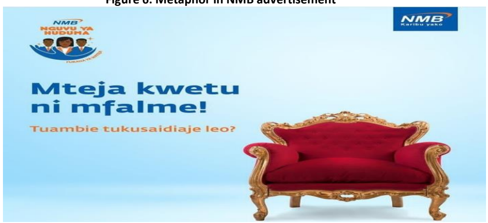
Figure 6: Metaphor in NMB advertisement