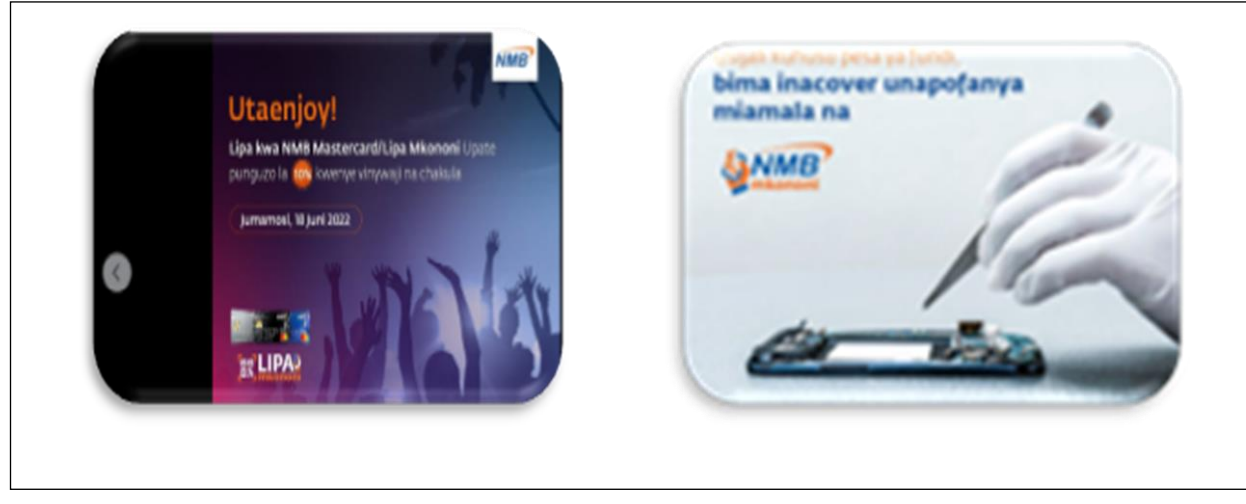
Figure 4: Code-mixing

Code-Mixing is a process of incorporating linguistic basic elements from one language, such as words, phrases and morphemes into an expression from another. Code mixing, according to Singh and Ghosh (2012), is the multilingual adaptation of a language that involves applying comparable words from one language to another without alteration. When a foreign word or term is included into a slogan for an advertisement, code-switching happens, creating a message that is in more than one language. Findings revealed that some NMB advertisements used codemixing as seen in figure 4.