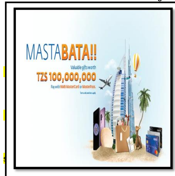
Figure 2: Exclamation Marks

attention so they would understand what was being conveyed. The salespeople added that exclamation marks are used to emphasize advertisements when a strong emotion is being expressed. According to Pepi (2018), the usage of exclamations in marketing is effective in that the target audience will be attracted by the exclamation's emotional connotations.