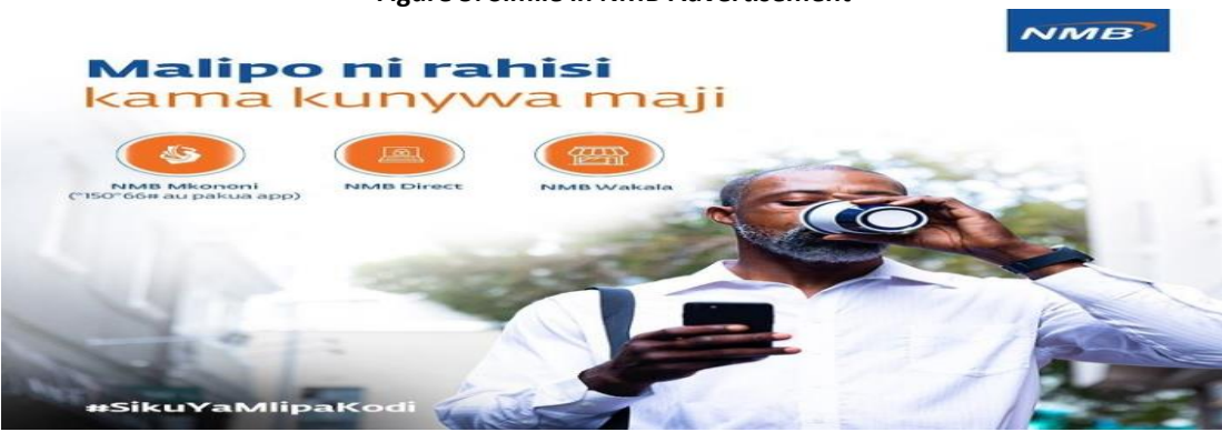
Figure 5: Simile in NMB Advertisement

The use of tactics or language to persuade an audience is known as rhetoric (sometimes known as stylistic device, persuasive device or just rhetoric). The researchers noted rhetorical devices that the advertisements used. Particularly, hyperbole, simile and metaphor were some of the rhetorical devices used in NMB advertisements as follows: