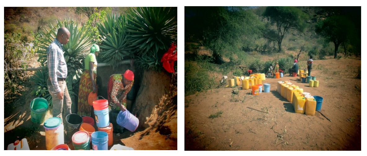
Figure 1: People collecting water from leaky water pipe at Mnenia

This result shows that pastoralist sometimes vandalizes water pipes to cope with scarcity of water in their village. The result suggest that although water service is the top priority need to the citizens, unaccountability, lack of ownership, the poor management and insecurity of the available water points endangering future of water services in Kondoa District council. The message derived from the quotation above calling for the collective responsibility for all citizens in collaboration with government to ensure the security of water infrastructures in rural areas.