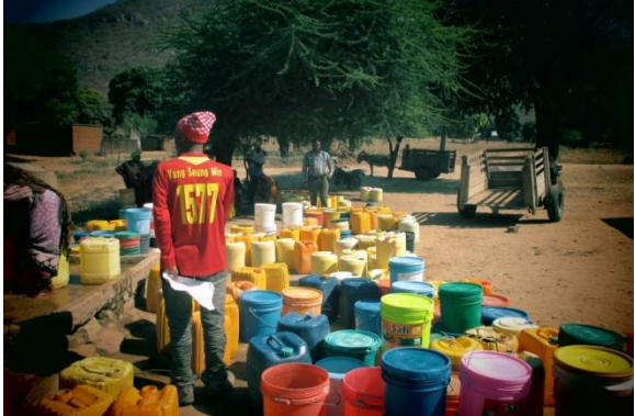
Figure 5: Residents are queuing for water service in Itundwi and Mnenia Villages

The observations revealed the presence of long queues of containers at the water points and confirmed the practice of recording number of buckets collected per day in the household (Figure 5) This implies that water crisis at the household levels needs special attention from government and responsible stakeholders.