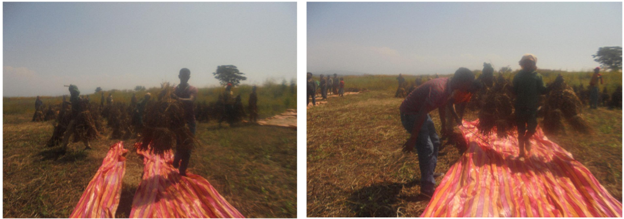
Figure 4. Bundle transport/ carrying on polypropylene sheets from field drying to threshing place for load tracking method to estimate shattering loss during transportation/carrying.

without the use of wrapping materials. The seeds that shattered on polypropylene sheet were measured and considered as equivalent quantitative loss during transportation of the bundles.