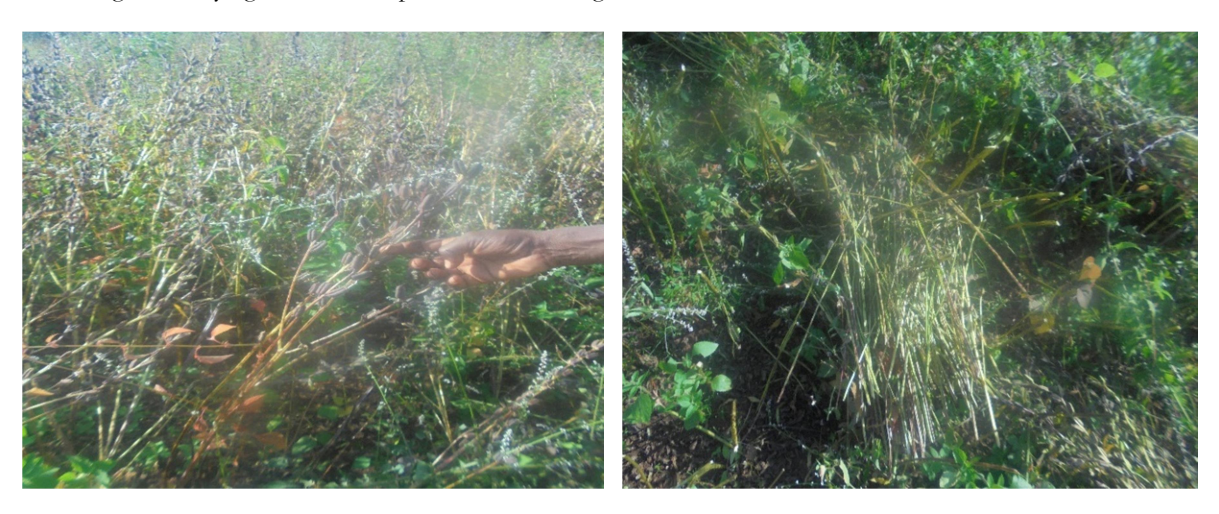
Figure 2. Harvesting stages and manual harvesting of sesame to estimate shattering loss during harvesting.

Loss due to capsules shattering before and during harvesting, was determined using selected quadrants. Figure 2 shows the stage of maturity at harvest and harvested sesame plants using hand sickles. To estimate the extent of losses on the field due to harvesting, five 1 m x1 m quadrants were selected from four corners and at the center of the 20 m x 20 m quadrants. Sesame harvesting was conducted when the color of the leaves are changed from green to yellow (before complete drying). However, some of the plants dried irregularly and started opening their pods due to different factors. So, to quantify the extent of losses before and after harvesting, the number of dried pods and opened pods in the 1 m<sup>2</sup> quadrant was identified and counted before starting harvesting. The average number of seeds per pod was determined and the average 1000 seed weight was measured using seed counter (Model: PFEUFFER GMBH, Germany). Once the sesame pods are dried and started opening their pods, the seeds shattered easily before and at harvesting. The opening of the pods and over-drying is an indication of loss. Finally, the measured pre-harvest and harvesting losses were added in the calculation of total potential harvest.