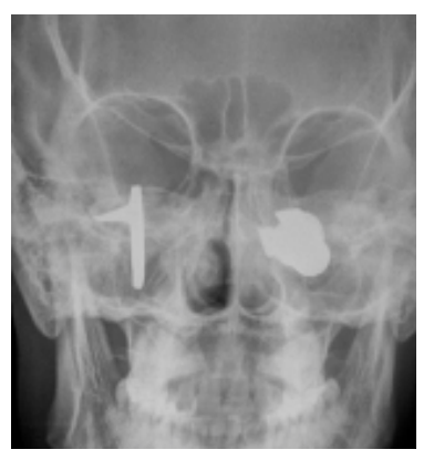
Figure 2a and 2b Plain radiographs of the patient showing bilateral retained intra-orbital metallic foreign bodies

examination under anesthesia, removal of foreign bodies, repair of globe laceration and cheek wound after review by the otolaryngologist. He received tetanus prophylaxis, systemic antibiotics and steroids.