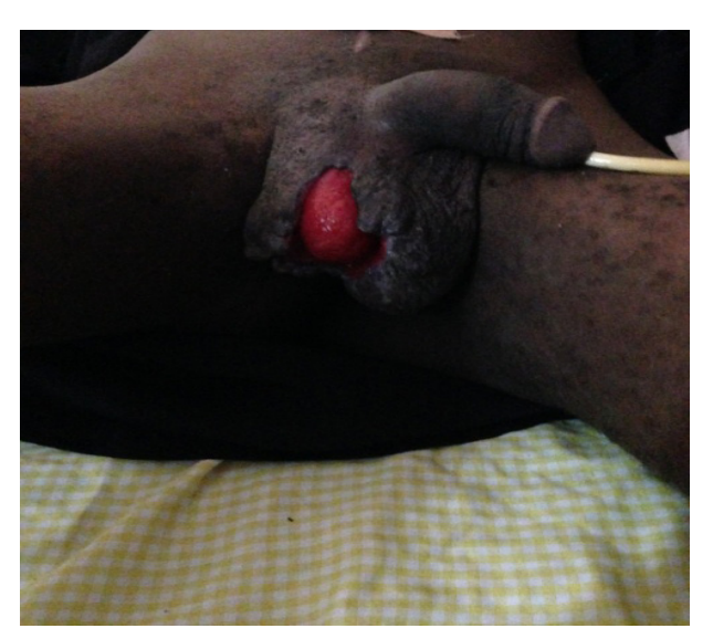
Figure 3 Clean granulated scrotal wound just before secondary closure