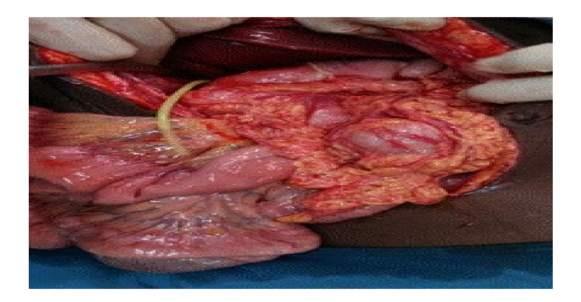
Image 1 Intraoperative picture showing the feeding tube in the upper abdominal area

Done : The site was covered and anchored at four points loosely with omentum. Peritoneal lavage was done. Drain left in-situ. Abdomen closed in layers and operation site dressed.