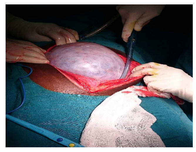
IMAGE C Intraoperatively- image of the ovarian cyst with the uterus at 22 weeks