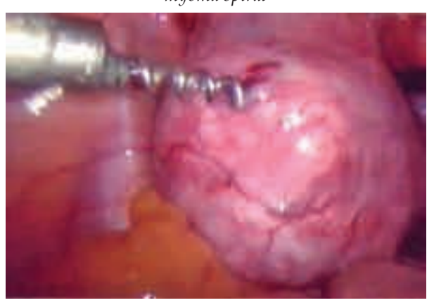
Figure 3 Appearance of the uterus after myomectomy