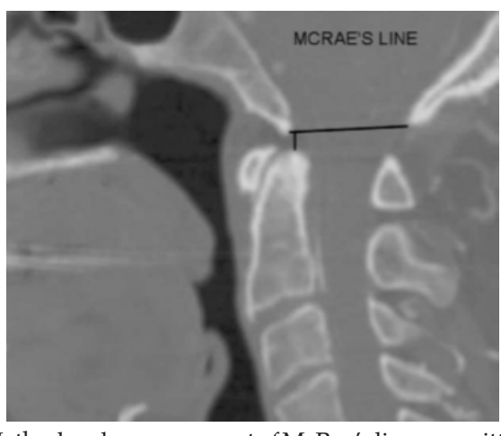
Method and measurement of McRae's line on sagittal CT brain image.