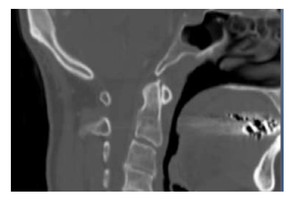
Method and measurement of McGregor's line on sagittal CT brain image.