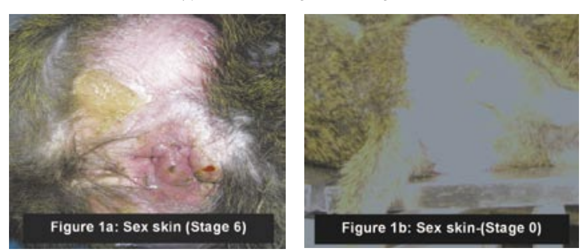
Figure 1a and 1b Some of perineal sex skin stages studied (stage 6 and 0)

Table 1 shows the different types of cells and epithelial thickness variation observed during the various stages of the baboon menstrual cycle. This table also shows the first and the last days of the cycle stages