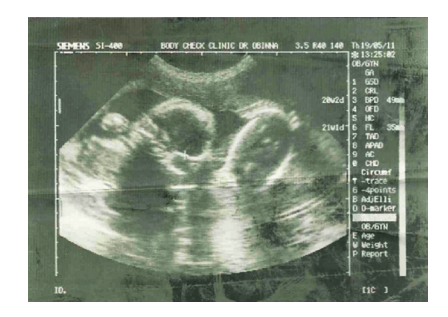
Figure 2a Retained placenta of first twin coexisting with second twin