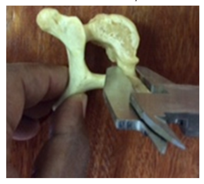
Figure 1 Measurement technique

Pedicle measurements were summarized using measures of central tendency and presented in tables. Histogram and box plots were plotted to show the distribution of measurement values graphically. Statistical difference in measurements between right and left side pedicles was evaluated using t-test for paired samples. The results for both right and left pedicles were pooled and analyzed. The mean, median, standard deviation, range and interquartile range for each thoracic level was determined and summarized in table. These results were compared with similar studies published in literature by use of a t-test. The studies in literature chosen must have had pooled means for all the twelve thoracic vertebra levels and accompanying standard deviations. The authors of publications that did not document the standard deviations were contacted by email and asked to provide the same.