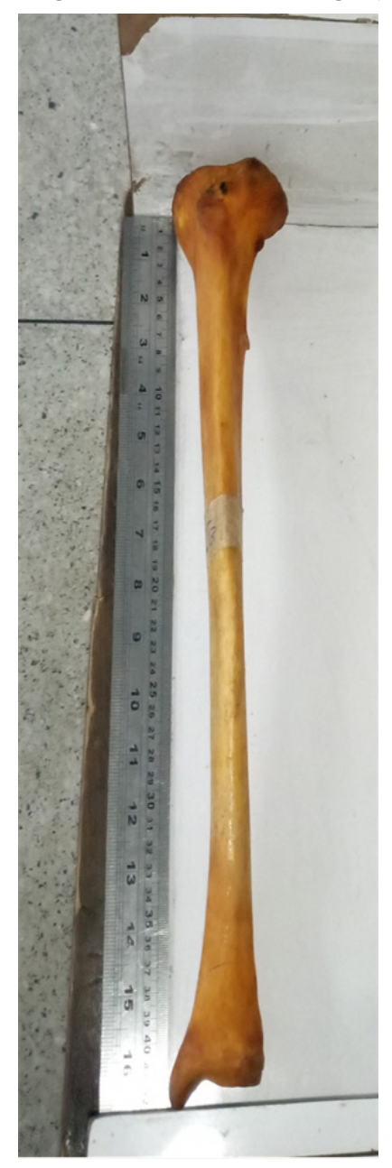
Figure 2 Measuring the Bicondylar Tibia Width (BTW)

Figure 1 Measuring the Maximum Tibial Length (MTL)