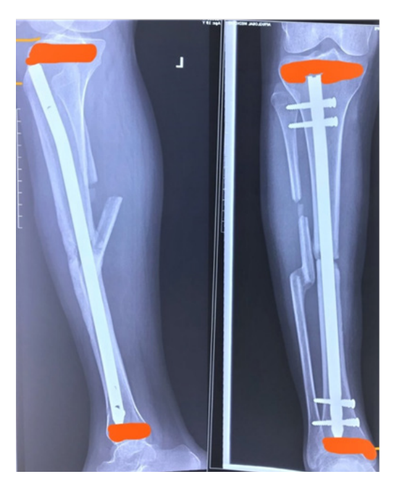
Image showing IM nail in situ and parts of the tibia bone not occupied by the IM nail (painted orange)