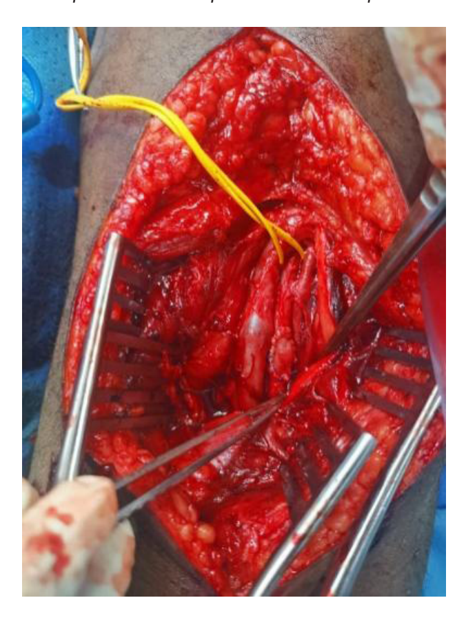
Figure 3 Popliteal anterior repaired with venous patch

There was return of the dorsalis pedis pulsation and the limb was subsequently well perfused. He did not demonstrate ischaemic changes on the leg on follow up at three months. The vascular repair was done by our vascular surgeon.