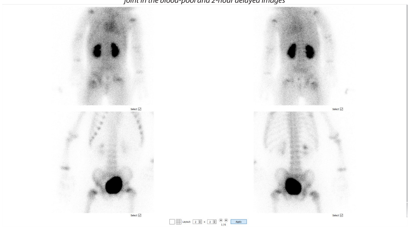
Example of a patient with septic arthritis of the left hip demonstrating increased tracer uptake on both sides of the hip joint in the blood-pool and 2-hour delayed images

Twenty-two patients underwent an arthrotomy based on clinical suspicion of septic arthritis, confirmed by bone scan findings. Only one patient underwent arthrotomy who did not have septic arthritis of the hip. This was an 11-monthold child with meningococcal septicaemia , raised inflammatory markers and increased blood pool activity around the hip on bone scan. No infective