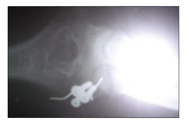
Check X-rays after twelve weeks