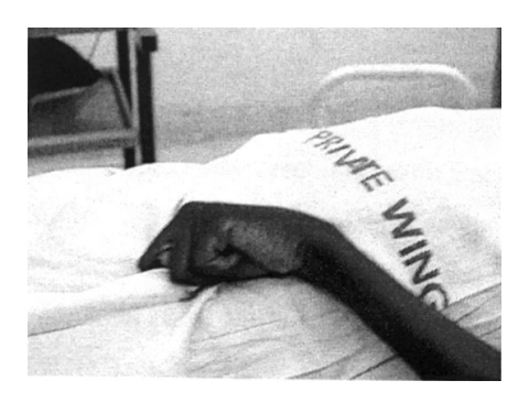
Figure 3: Case 1: Left wrist drop