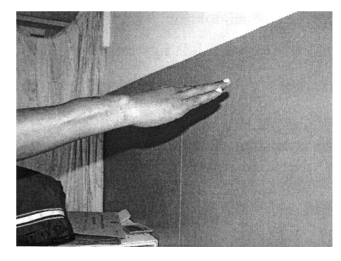
Figure 5: Case 2: Wrist and finger extention

At 3 ½ months he had good active extension of the fingers and thumb and wrist extension had power grade III. Thumb abduction was good. He was still on follow up.