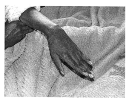
Figure 4: Case 1: Finger thumb extension and thumb abduction

Case 2 : A 29 year old right handed paramilitary male who sustained fractures of the right humerus and right radius and ulna in a lorry accident. He was admitted to KNH in March 2007 where a right wrist drop and neurological signs similar to case one were noted. Plating of the fractures was done. The radial nerve was in continuity. No radial neurological recovery was evident after 19 months. He had some stiffness supination. Tendon transfers were done as in case one, except that the flexor carpi radialis was transferred to both extensor carpi radialis longus and brevis.