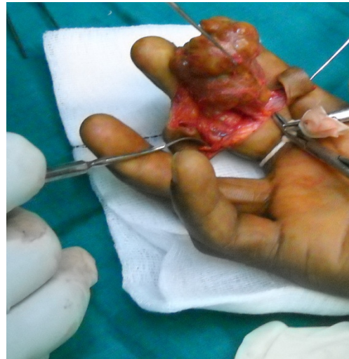
Figure 2. Intraoperative view of a yellowish lobulated lesion.