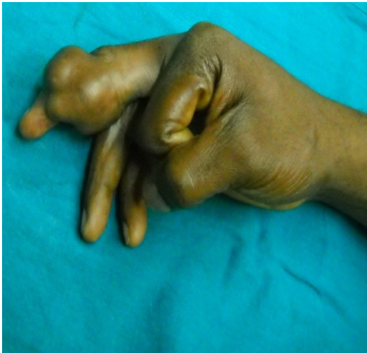
Figure 1. A typical Giant cell tumour of the tendon sheath.

Soft tissue sarcoma involving the hand are uncommon and make up 8% of the hand tumours surgically treated 24 . The eight patients seen in this study included 5 with fibrosarcoma, one each with epithelioid sarcoma, glomangiosarcoma and a neurofibrosarcoma. The absence of sarcomas of bony origin from our series may reflect the general rarity of primary bone sarcomas in the hand. There is a wide range of subtypes with different disease pattern, recurrence, metastasis and response to treatment. They commonly present as painless masses.