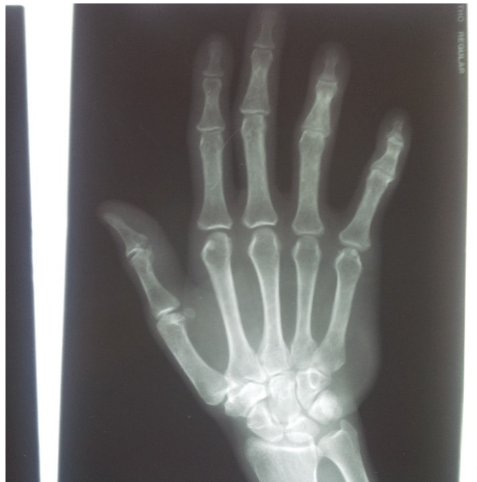
Figure 2 . Plain radiograph of the right hand

The mass was apparent on plain radiograph as a hypo dense circumscribed lesion at the base of the little finger (Figure 2). A diagnosis of right palmar soft tissue tumour was made.