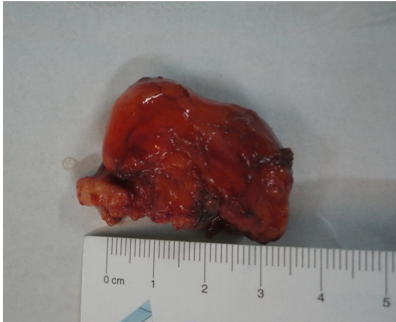
Figure 3. Photograph of gross specimen showing a circumscribed lobulated yellow mass

Her surgery was performed under wrist block with 0.5% lignocaine solution. A longitudinal incision was made and the intraoperative finding was that of a circumscribed yellowish mass located deep to the hypothenar muscles with attachment to the metacarpophalangeal joint of the little finger by a fibrous band. Marginal excision of the tumour was done. The tumour measured 4 cm by 3 cm and weighed 9 grams (Figure 3). Haemostasis was secured and the wound cavity was irrigated with saline and closed in layers. She was managed on outpatient basis.