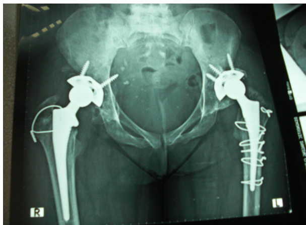
Figure 4. Bilateral total hip replacement in a sickler