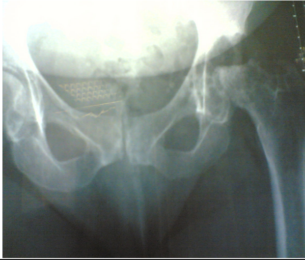
Figure 2. Ficat Grade 4 Avascular Necrosis of Femoral Head in a Sickler