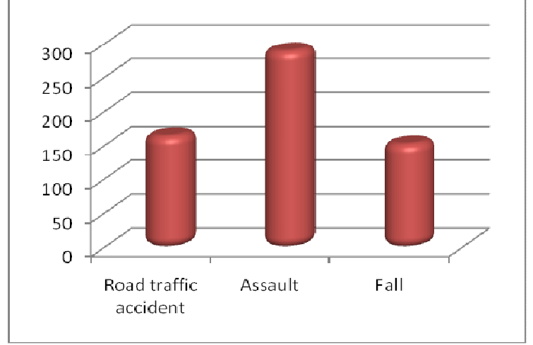
Figure 2. Actiology of intracranial hematoma