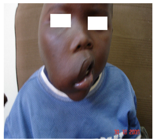
Figure 3a. Patient with lymphatic malformation on the right facial region before treatment