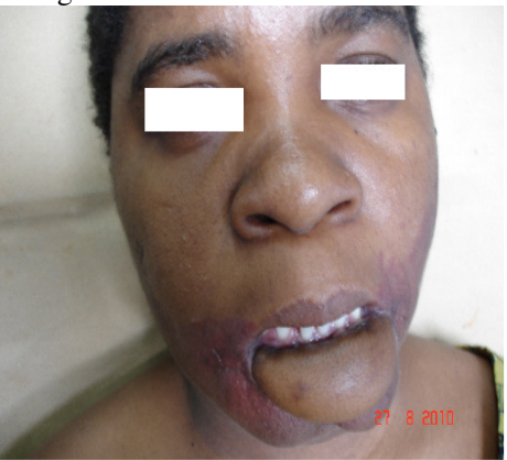
Figure 4b. Patient in Figure 4a after surgery. Radial forearm flap was used to reconstruct the lip (Improved)