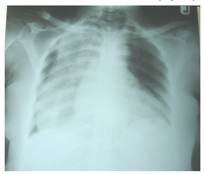
Figure 1. Chest X-ray for end-stage Achalasia showing right chest opacity due to the dilated esophagus

The patient was counseled and prepared for oesophagectomy. Transhiatal oesophagectomy with cervical oesophagogastrostomy was done. The postoperative recovery was stable and she was commenced on graded oral sips 7 days postoperatively. The chest tube was removed 2 days later and she was discharged on 12<sup>th</sup> day postoperatively. When seen 2 weeks at the out-patient department clinic she was stable. She was noticed to develop keloid on the scar 6 months later but she has remained stable and satisfied 18 months after the oesophagectomy.