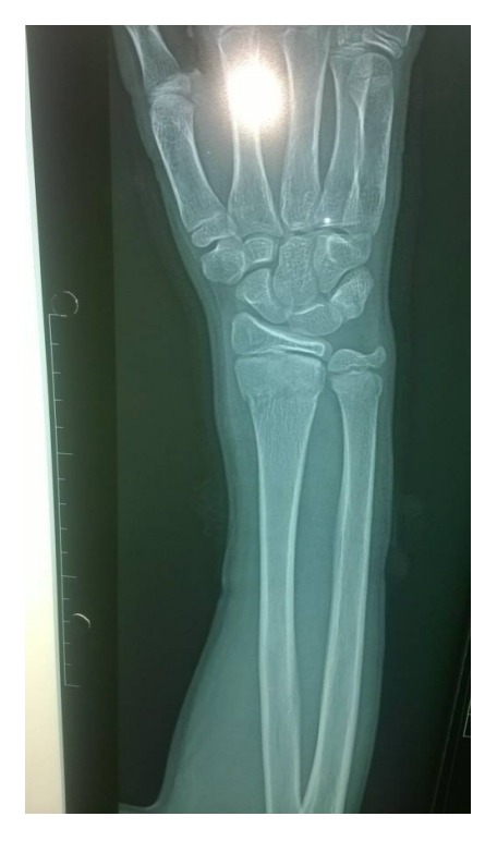
Post-operative AP View

Attempt at closed manipulation and reduction failed and open reduction with excision of the dislocated pisiform was done and FCU and pisocarpitate ligament repaired. The radius /ulna fracture was reduced and cast applied. On follow up, the fracture healed without sequelae with normal wrist function of grip power and range of motion.