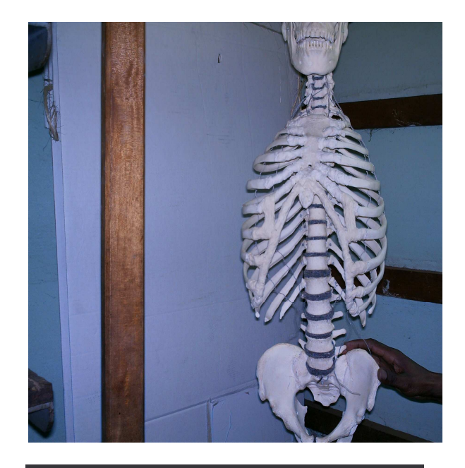
Figure 4. Shows defect in sternum, a long manubrium of sternum up to the level of third costal cartilage attachment in an individual with supernumerary thoracic vertebrae and subnumerary lumbar vertebrae. Note the two floating ribs