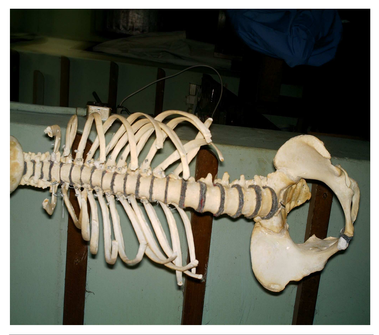
Figure 1. A case of subnumerary thoracic vertebrae with eleven corresponding pairs of ribs

An adult male had thirteen pairs of ribs and corresponding thoracic vertebrae. The vertebrae had the normal characteristics of thoracic nature. The rib cage had eleven pairs that were attached while the 12<sup>th</sup> and 13<sup>th</sup> pairs were floating (Figure 3). The manubrium of the sternum was much longer and ended at the sternal angle which was at the same level as the third coastal cartilage attachment and had three costal cartilages attached on either side instead of the usual two pairs. There was an oval deficit in the body of the sternum at the level of attachment for the 5<sup>th</sup> costal cartilage.Fig 4