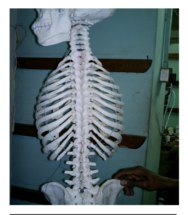
Figure 3. Shows thirteen thoracic vertebrae with thirteen pairs of ribs and a subnumerally number of four lumbar vertebrae<mark>.</mark>