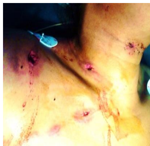
Figure 7. Penetrating wounds produced by the shotgun pellets