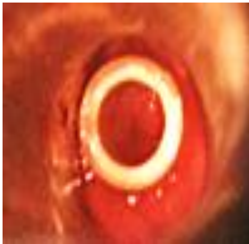
Figure 4. Improved laryngeal stent insitu