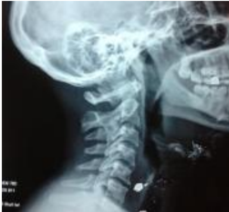
Figure 8. Check X-ray 3 Weeks after Surgery