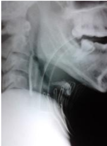
Figure 1. Preoperative X-ray Showing the Foreign Body and Endotracheal Tube

Though the patient was haemodynamically stable with only mild signs of respiratory distress, because of the mechanism of the injury and the multiple injury points, we decided to perform a computed tomographic angiography (CTA) to rule out any vascular or aerodigestive tract injuries. This revealed no vascular injury but 3 bullet pellets were noticed in the right side of the neck and there was a comminuted fracture of the lower edge of left mandible medially spilling multiple fragments of the bone in the floor of mouth, and elevating the floor of the mouth. There was also a comminuted fracture of the hyoid bone and midline fracture of the thyroid cartilage with its right ala displaced medially, partially blocking the laryngeal vestibule. The CTA also revealed extensive soft tissue emphysema of neck and superior mediastinum. All major blood vessels and trachea were intact.