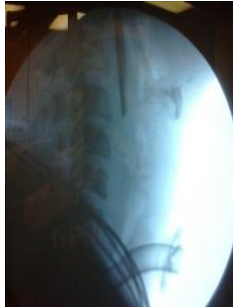
Figure 2. Post Laryngeal Repair X-ray-still Showing the Foreign Body