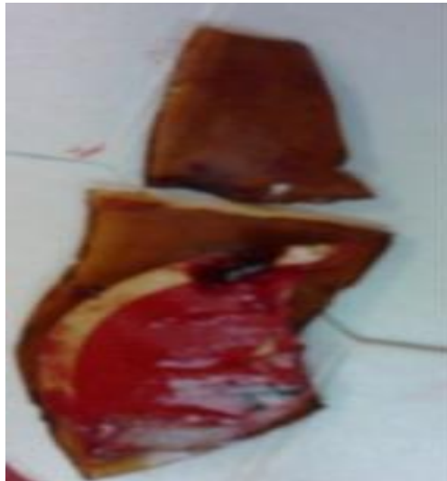
Figure 3. Broken Bottle Glass Pieces with Brand Label Still Intact