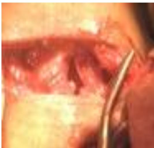
Figure 5. Laceration in the Cricothyroid Membrane