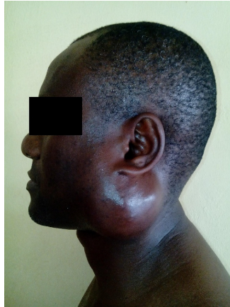
Figure-1. Left side view of the patient showing the mass.

other known chronic medical condition. He has no history of head and neck irradiation. He had no family history of cancer and had never smoked tobacco or taken alcohol.