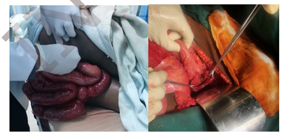
Figure 1: Transanal small bowel evisceration Figure2: Rectosigmoid Perforation on antimesenteric side

CONCLUSION: Awareness of transanal small bowel evisceration as a rare complication of rectal prolapse by medical providers will result in efficient and prompt response in emergency setting, resulting in better outcomes for patients.