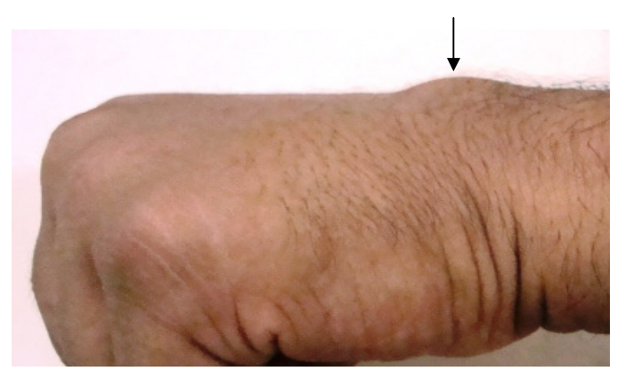
Figure 1. Typical appearance of ganglion cyst of the wrist.

All of them presented to our hospital for the first time and did not have a history of aspiration elsewhere or a previous surgical excision. Six patients came for fine needle aspiration of unrelated conditions and during their visit to the doctor for these, they mentioned the presence of another lump which was either asymptomatic or causing some pain or limitation of movement.