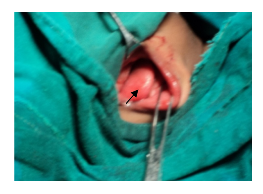
Figure 3: Immediate postoperative period; tongue restored to its position

The neonate was discharged on the third day postoperatively able to breastfeed. The histology reported a fibrous cyst wall lined by stratified squamous epithelium. There were mucous glands seen in the wall, with a conclusion of a simple cyst.