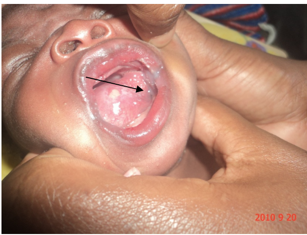
Figure 1: Cyst covering most of oral tavity, tongue on extreme left

Pre-operative supportive treatment included antibiotics and intravenous fluids. Intraoperatively, the child was induced and intubated nasotracheally. Excision of the cyst was done, by dissecting it out, after packing the posterior oral cavity. Closure was done using absorbable suture. There was mucinous material in the cyst. See Figure 2. Capsule was taken for histology. The neonate was reversed successfully and had restoration of normal anatomy in the oral cavity. See Figure 3. The immediate post operative period was uneventful and the neonate was slowly reintroduced to feeds after 12hours.