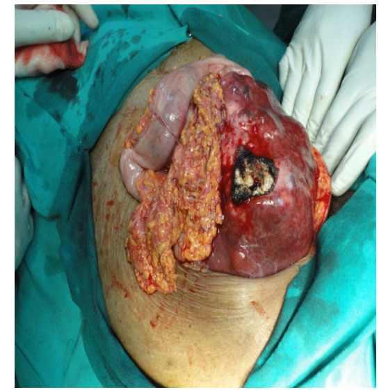
Figure 2. Wandering Liver Delivered out of the Wound