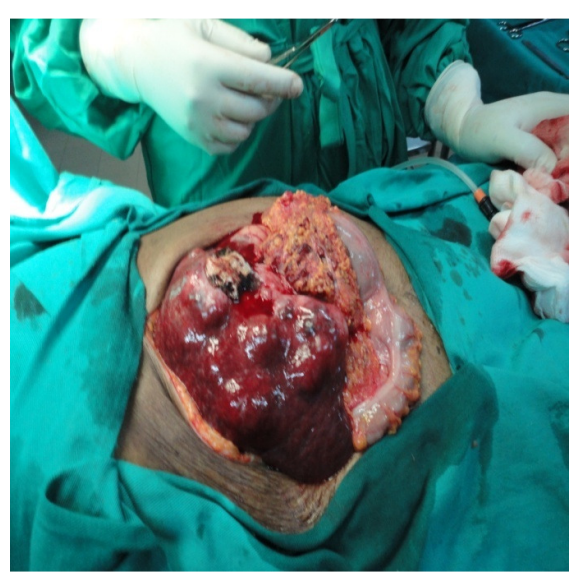
Figure 1. Wandering with Nodular Masses

There was moderate straw-colored Ascites. The liver was enlarged with multiple, hard masses involving the right and left lobes. The masses were of varying sizes and were more in the right lobe; the largest was about 8 cm in diameter and was located in the right lobe. There were adhesions onto the omentum and transverse colon.