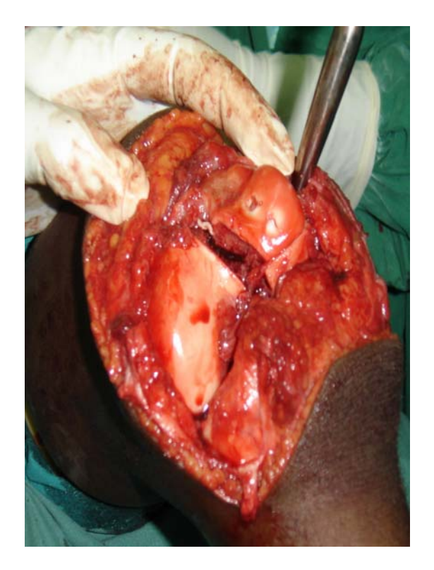
Figure 3. Intra-operative photo of left knee after partial reduction

Figure 2. Intra-operative photo of left knee showing fracture fragment displaced posteriorly and superiorly, leaving only anterior half of lateral femoral epiphysis in anatomical location