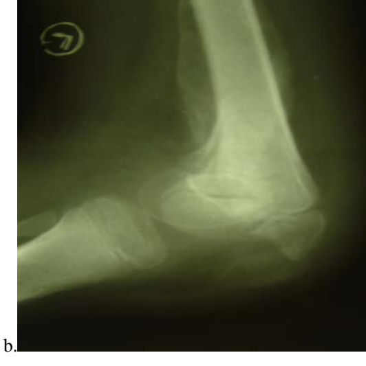
Figure 1.a and b. AP and lateral X-rays of the left knee on admission