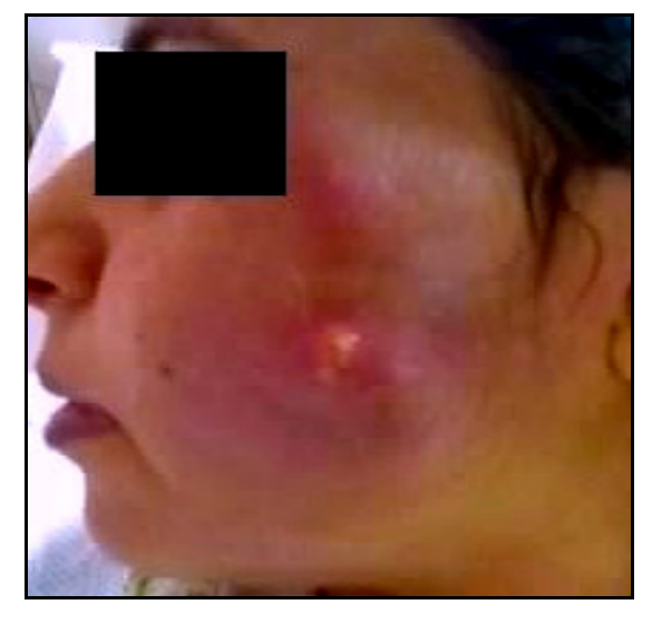
Figure 1. Left Facial Abscesses 7 Days after Dermal Filler Injections

A 39 years old lady reported with left facial swelling and pain of 4 days duration. The patient initially denied any sort of intervention but after proper counseling, revealed the history of having received facial dermal filler injections at the hands of an uncertified practitioner. The patient was totally unaware of the nature of the dermal filler or the possible complications of the procedure. On examination, the patient was febrile and had erythema and tenderness over left side of face with pus pointing at one spot (Fig1). Laboratory works showed leucocytosis with shift to the left (WBC- 18200/cc with 91% Neutrophils). Imaging by ultrasound revealed multiple small abscesses over the left face ranging in size from 5mm to 7 mm (Fig2) and a single big abscess measuring 35mm x 29mm (Fig 3). The bigger abscess was stabbed and drained under conscious sedation. The abscess contained frank pus which grew Staphylococcus aureus sensitive to amoxicillin/clavulanic acid. After 8 days of antibiotic intake, the patient became asymptomatic and all features of inflammation subsided and there were no residual cosmetic deformities. She was followed up for 6 months and there were no further events.