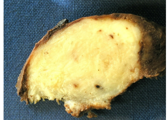
Figure 2. Gross appearance of the lesion: cut gray-white solid, invasive border.

Lung tissue (2 lobes) with a 5 cm mass attached to the lung by a stalk. <u>Cut surface</u>: gray white solid, surrounded by a small rim of lung ______ parenchyma, invasive border. (fig 2).