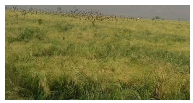
Fig 2. Flock of birds attacking irrigated tef in Kobo-Girana Valley

contiguous plots of land, bird attack is extended for longer period. Therefore, encouraging farmers to grow uniformly maturing groups of tef will help to shorten the time period during which tef is exposed to attack by birds. Moreover, in the Rift Valley of Ethiopia, chemicals such as Methiocarb have been recommended to repel birds from sorghum (Bruggers et al. , 1981).