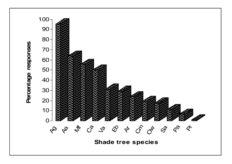
Figure 1. Responses of farmers for the best coffee shade tree species propagation for wide spread usage in their respective plots, Southwestern Ethiopia. Abbreviations: Ag= Albizia gummifera, Aa= Acacia abyssinica, Mf= Millettia ferruginea, Ca= Cordia africana, Va= Vernonia amygdalina, Eb=

for wide spread usage in their farms/fields because of their good features as shade tree species (Fig. 1).