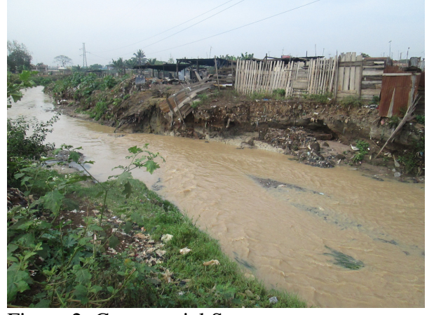
Figure 2: Commercial Structure Development along the Sisai River

Physical structures (mainly residential, religious and wooden structures) have extensively been developed in the valleys of the rivers under study. The structures are built mainly on the courses of the rivers obstructing their flow and expansion. Car washing bays have also been built on the courses of the Sisai and Wiwi rivers. It should be noted that the Wiwi River had no physical structure developed along its course. The worst affected was the Sisai where apart from residential houses, commercial activities including smoking of fish, palm-kennel processing, cattle ranch, charcoal burning among others go on close to the course of the river. Figure 2 shows the Sisai River with commercial structures (wooden cattle ranch and fish smoking) developed at the right bank of the river.