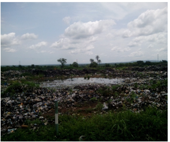
Fig.2: Gbagede dumpsite

A case study research method was adopted for three existing hand dug wells; GW1, GW2, GW3 located at 186 m, 290 m and 326 m respectively from the edge of the dumpsite were used as water sample points for groundwater quality tests. Water samples collected in 150cl empty bottles that were earlier washed and cleaned with sterile Each sample was labelled water. according to the location, preserved at 4 °C and transported to the Chemistry Laboratory, University of Ilorin to determine physicochemical the parameters in each sample. Parameters evaluated include: pH, total hardness, Total Dissolved Solids (TDS), Total Suspended Solids (TSS), alkalinity, turbidity, Chemical Oxygen Demand (COD), Biochemical Oxygen Demand (BOD), Dissolved Oxygen (DO), Nitrate ion, Chloride ion, Sulphate ion, Electrical conductivity, Calcium ion and Magnesium ion using standard laboratory procedures. Some of the parameters were recorded in-situ at the point of sampling while the analyses of other various water parameters conducted quality were