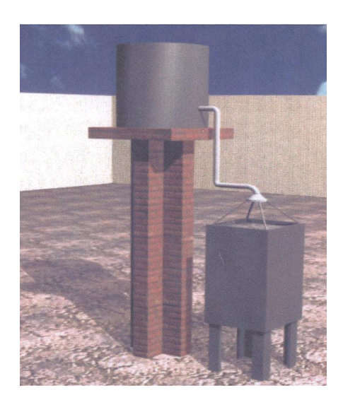
Figure 1. Sectional view of the waste treatment plant