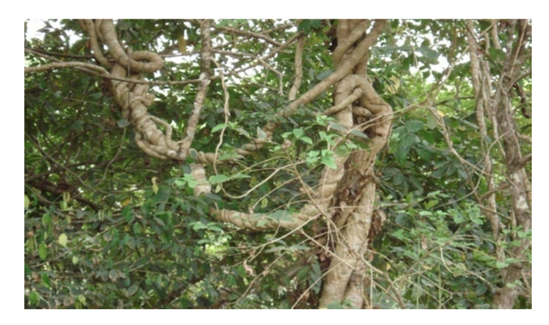
Plate 1: Climbing and tangle vegetation in zone A of the sampled reach along River Ka