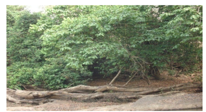
Plate 3: Fallen vegetation from the bank into the river channel River Kam

(2b) Plates 2a and b: Burned vegetation exposing bare surface, 2a depicting zones B and C from the river channel and 2b some distance from the river channel