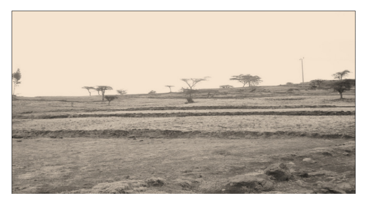
Figure 7 Soil Bunds in Danech