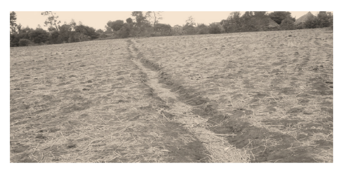
Figure 6 Indigenous Drainage Ditches, Datewezir

Soil and Water Conservation Management through......Mushir & Kedru EJESM Vol. 5 No. 4 2012