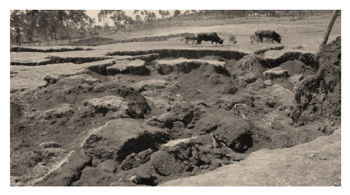
Figure 2 Formation of Active Gullies in A/Mukere

control practice factor. The results of the application of the Hurni's modified USLE revealed that in the study area an annual soil loss of about 114.59 tons/ha/year on the steep slopes lying between high and middle altitudes indicate the necessity of soil and water conservation measures implementation as well (Table 3).