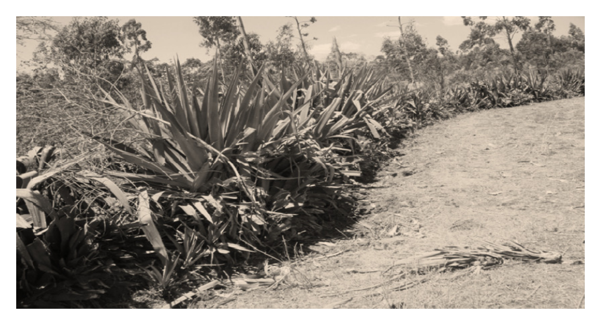
Figure 5 Plantation of Sisal and Euphorbia, D/Mukere