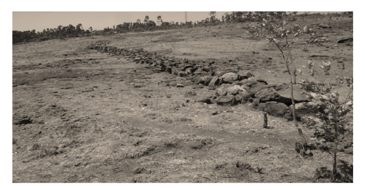
Figure 4 Stone Bunds are Common on Steep Slopes, Anshebeso