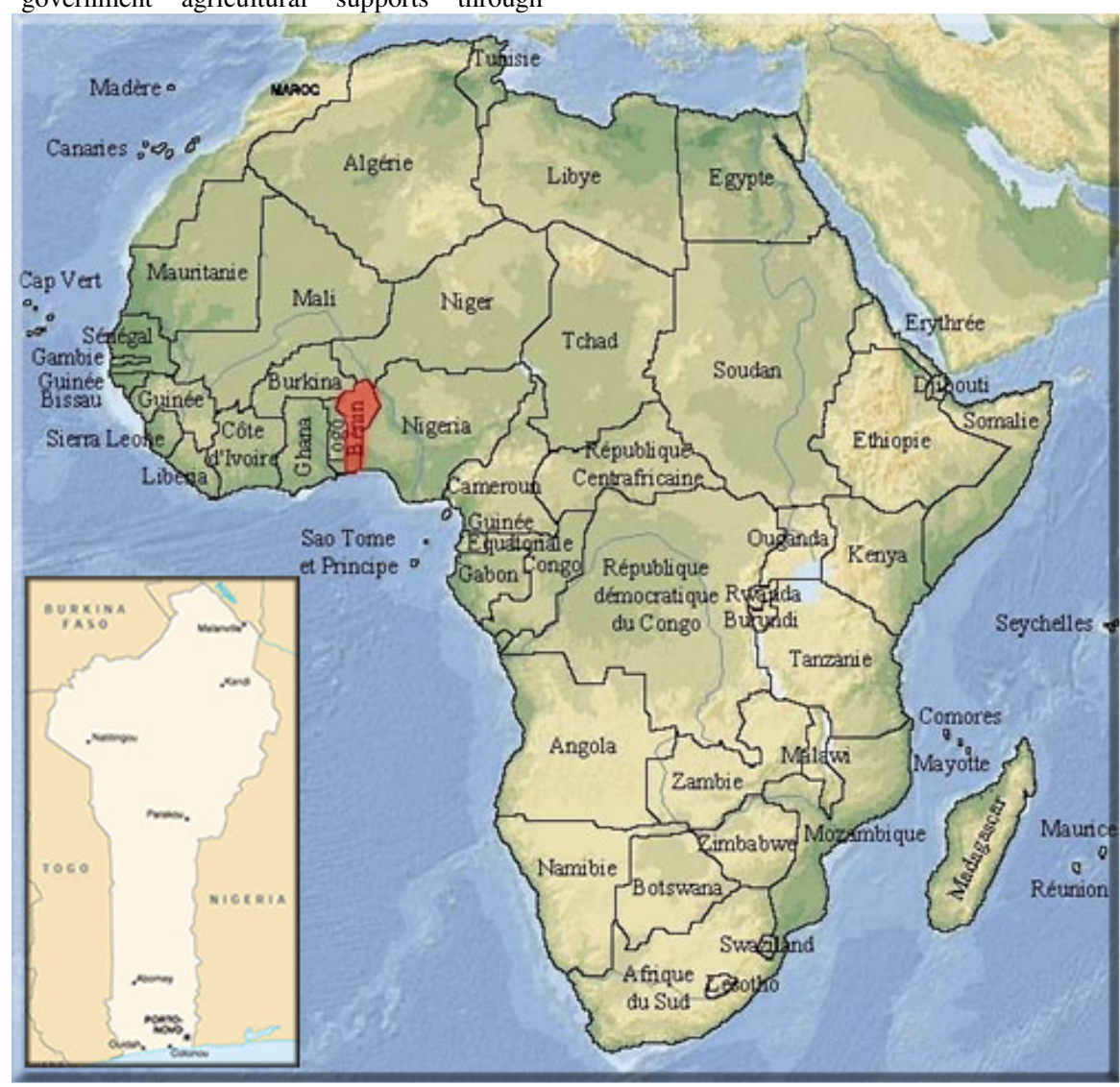
Figure 1 Benin Localization Map

research and extension were misdirected and expensive (Modest , 2000; MAEP-MDEF, 2006).