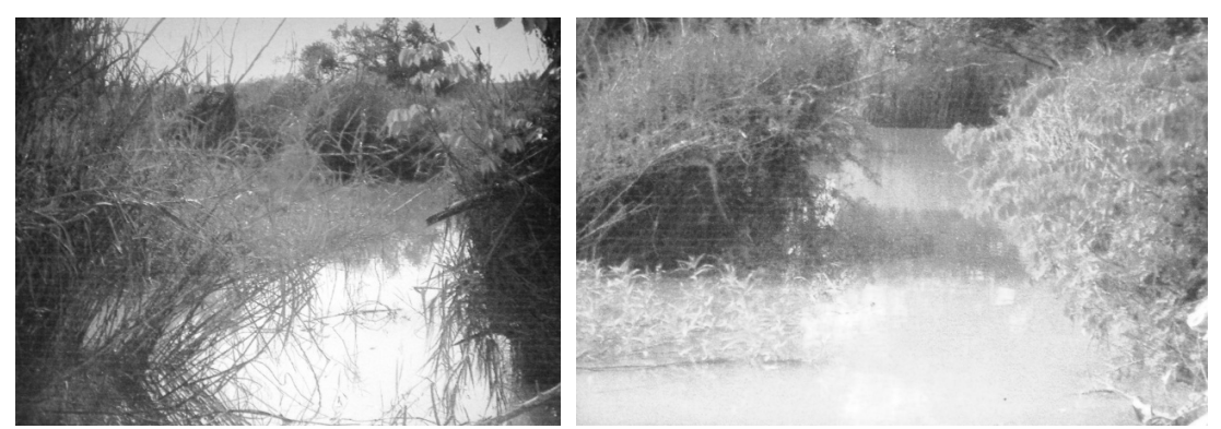
Figure 1 River channel overgrown with vegetation at Ch 3 + 300 and Ch 4 + 800

The river profile showed that the river bed at some downstream portions of the river have higher average elevations than upstream portions of the river indicating the possibility of silting at such downstream portions. Such presence of silting reduces the water pass-way making it insufficient to accommodate the flood time flow. The survey identified factors responsible for blockades of the river flow to include grown vegetation and fallen trees in the river channel as shown in Figure 1; disposal of industrial and domestic wastes into the river channel as seen in Figure 2 and construction of structures on the river flood plain and its banks as shown in Figure 3. Farming activities which could lead to increase in erosion activities of the river's adjoining areas was common in the river banks and adjoining areas. Figure 4 shows the river bed profile between Chainage 9+000 and 10+450 indicating areas of possible built up of silt in the river channel.