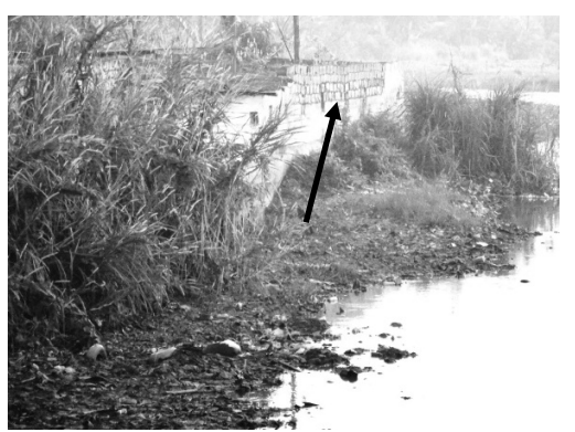
Figure 3 Wall fence close to River channel at Ch 6+850