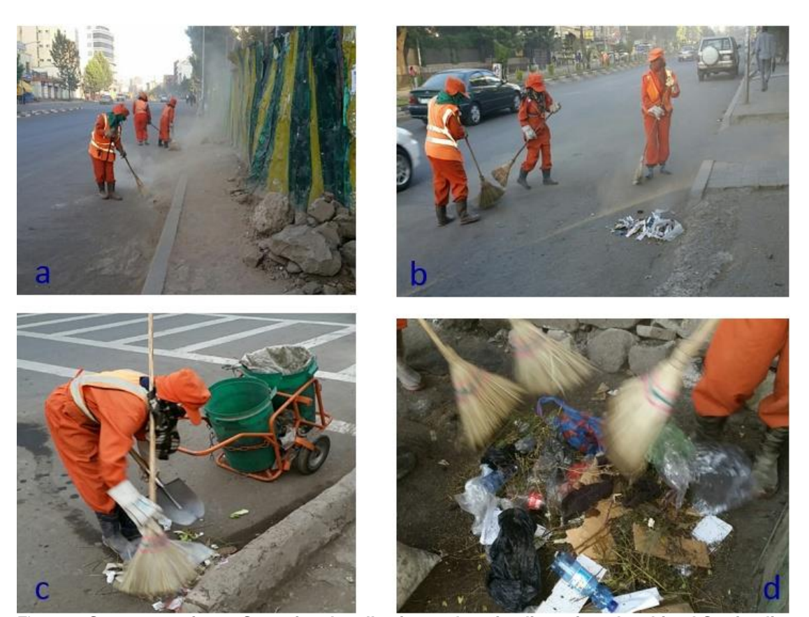
Figure 3: Street sweeping: a-Sweeping; b-collecting; c-dumping litters into dust bin; d-Sorting litters, Nov 2016

The exposure to dust presumably depended on the time covered and the intensity of sweeping. The first km had much sweeping and heavy dust plumes, as the sides are routinely busy with accommodating taxis and road-side businesses such as street food selling and many other nameless petty things. These activities are known to involve massive human movements which leave themselves things like litter, dirt, papers, plastic bags, leaves and straws of khat , used mobile phone cards, card boards, and debris (Figure 3).