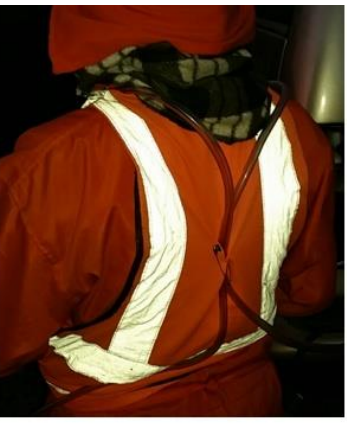
Back side arrangement